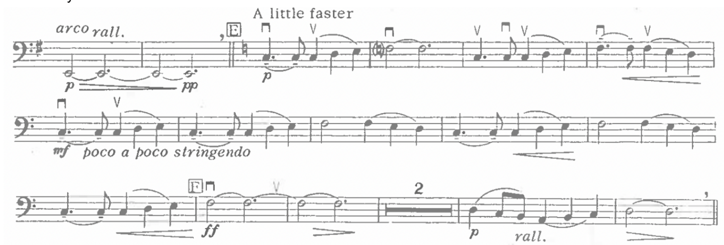
Excerpt 6: Serenade for Strings, Cakewalk by Leyden

Play mm. 5 measures before F - Downbeat of H - after Letter G please play the smaller cued notes where the marcato section starts for the audition.