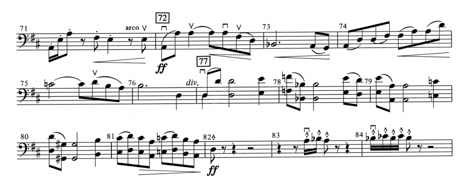
Excerpt 4: Overture to the Wind by Kirt N. Mosier

Play mm. Upbeat to 72 - Downbeat of 82 Somewhat slower - Quarter note = 96