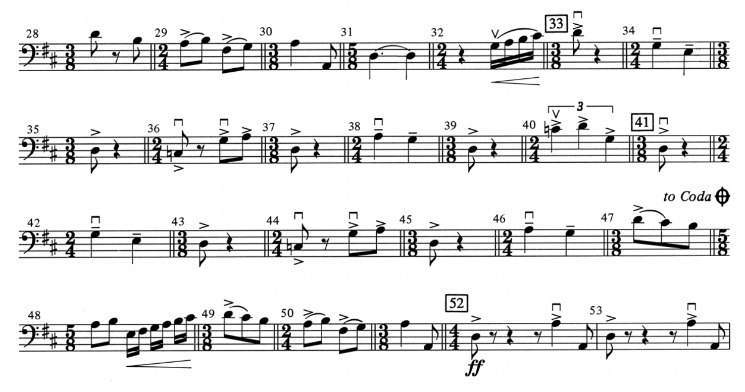
Excerpt 2: Overture to the Wind by Kirt N. Mosier